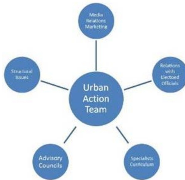
Figure 2. Urban Action Team Focus Issues

The team met again in September 2013 with recommendation they felt would strengthen the Kentucky Extension system, but could also be applied in other states. The recommendations were as follows.