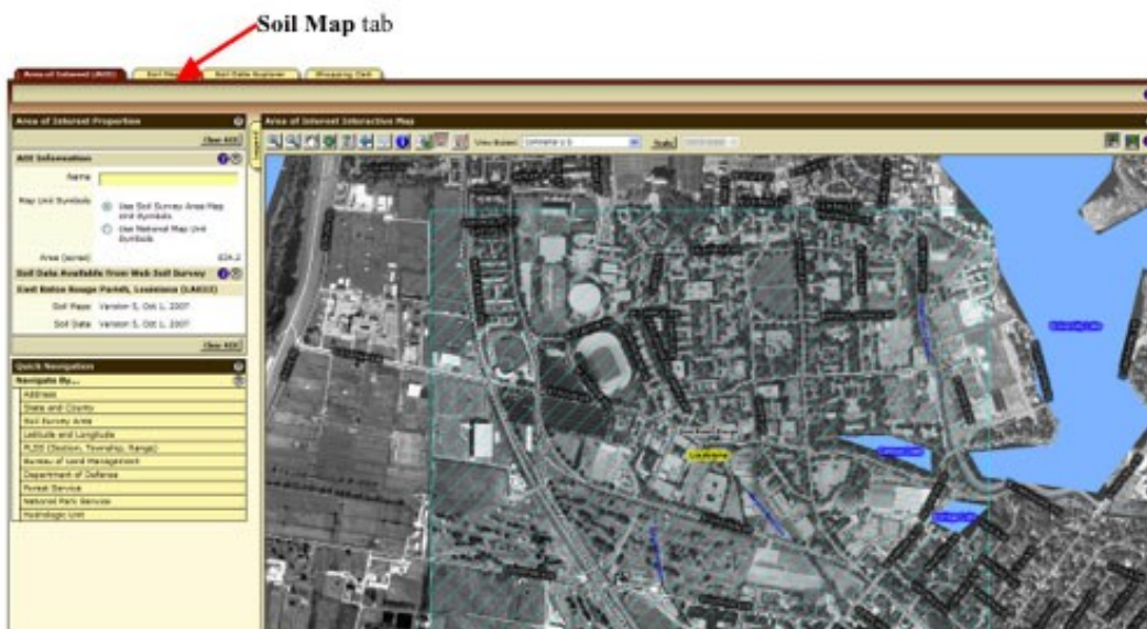
Figure 2. Viewing Soil Series Information for the Area of Interest

As you are clicking to define your area a red line will outline the area of interest. The line will then turn to light blue once the area is defined. After that, select tabs for the information you want. The Soil Map tab (selected in Figure 2, indicated by red arrow) allows you to view the soil series mapped on the property. The associated table lists the soil series' names and the acres of each series mapped. You can select the soil series within the table and a list of properties will appear that gives information about the texture, depth to limiting layer and other features about the soil.